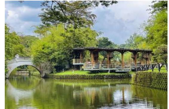
Perdana Botanical Gardens