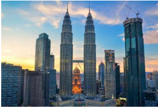
Petronas Twin Tower